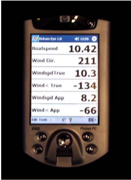
Eye displaying data